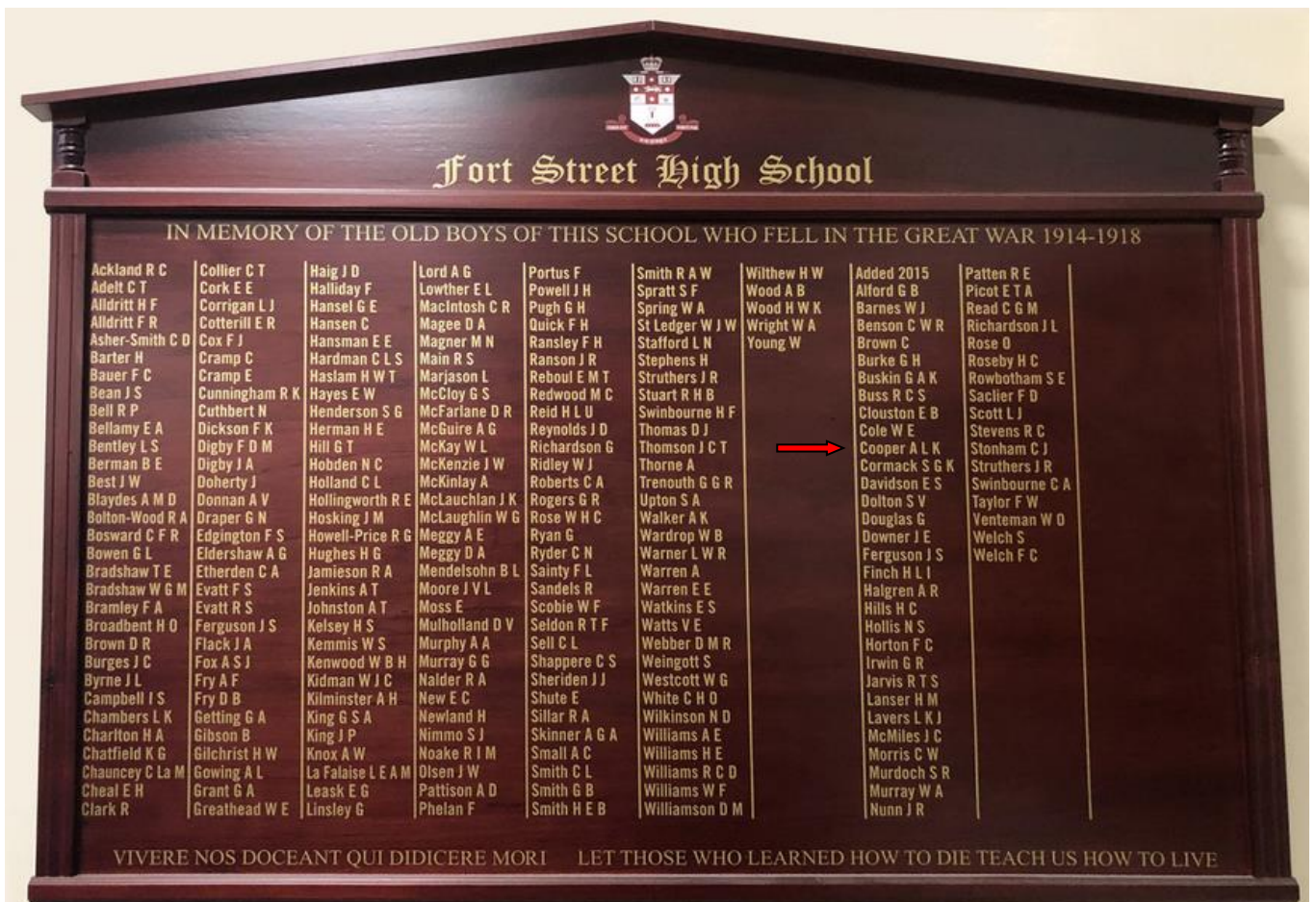
Fort Street High School Honour Roll