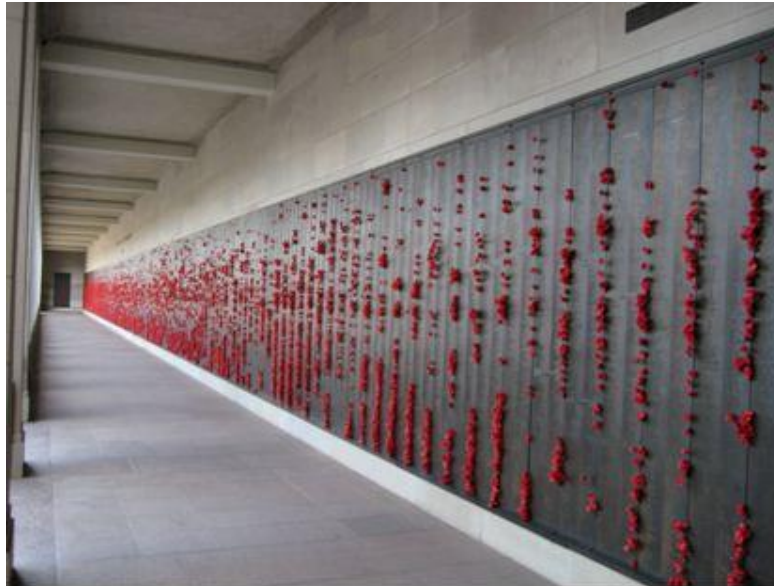
Roll Of Honour WW1 Australian War Memorial Canberra, Australia